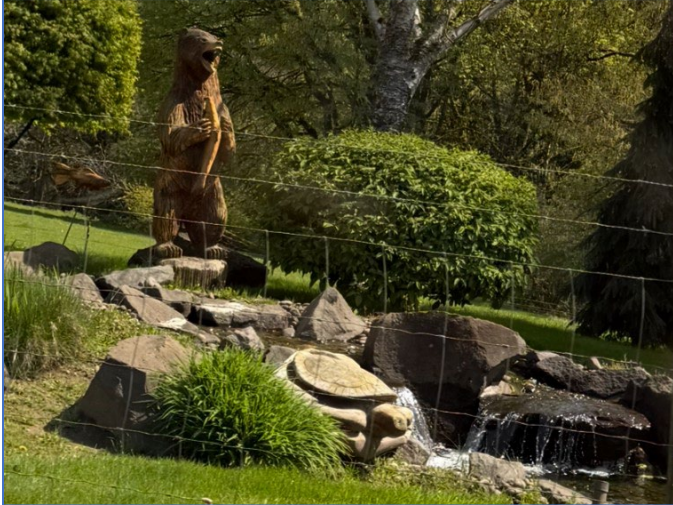
Zylstra Farm carving

The 2026 Mountains to the Sea Rally started at Dealers Supply in northwest Portland. The 30-minute odometer calibration transit traveled north up Interstate 5 to Ridgefield, Washington, to end at the Catholic Church, less than a mile off the freeway.