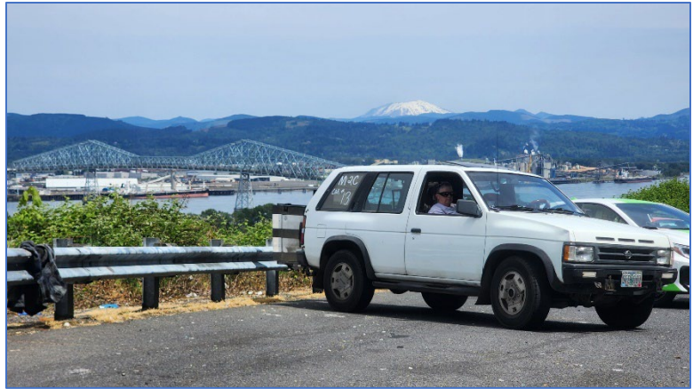
Car 13 awaits their after-lunch restart at the viewpoint overlooking the Lewis & Clark Bridge, with Mount St. Helens in the background.

After the lunch transit, the route traveled along less-traveled roads, including scenic Beaver Falls Road, to arrive in downtown Clatskanie. A six-minute transit through Clatskanie directed teams to head south on Hwy 47. A bit over ten twisty miles later, the route headed west on Hwy 202 for another almost twenty miles, to the afternoon break at the Jewel Meadows Wildlife Area.