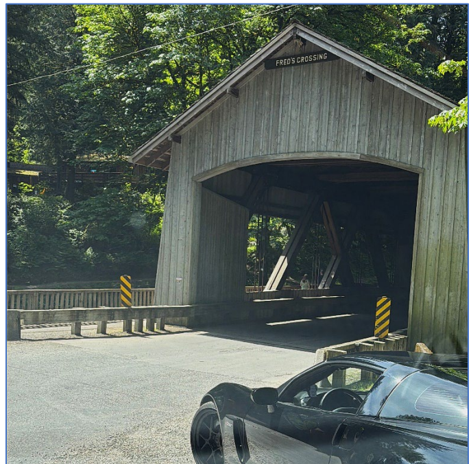
Cedar Creek Covered Bridge

The second leg was under three and half miles long and included five speed changes, four of