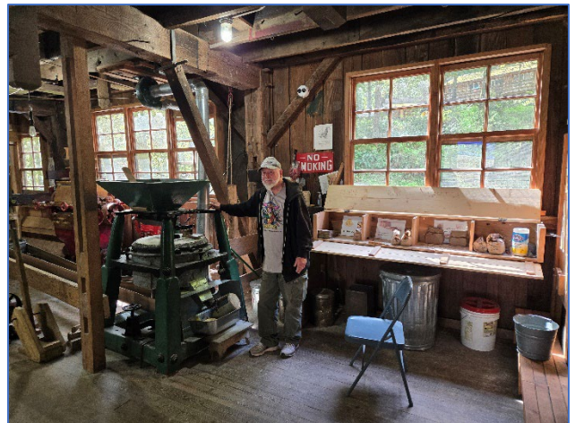
Cedar Creek Grist Mill operator opens, offers tours to April Rally participants

Mountains to the Sea registration closes May 6 .