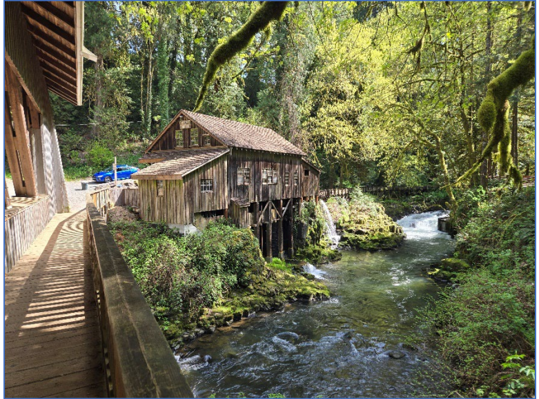
Cedar Creek Grist Mill

In addition to the OR instruction mentioned above, there were two more OR instructions required to support the two routes that resulted from a tricky triangle protection trap. You are looking for an S first OPP and this is it! If you go straight and then just keep on going, then you have missed the back-facing stop sign on the road